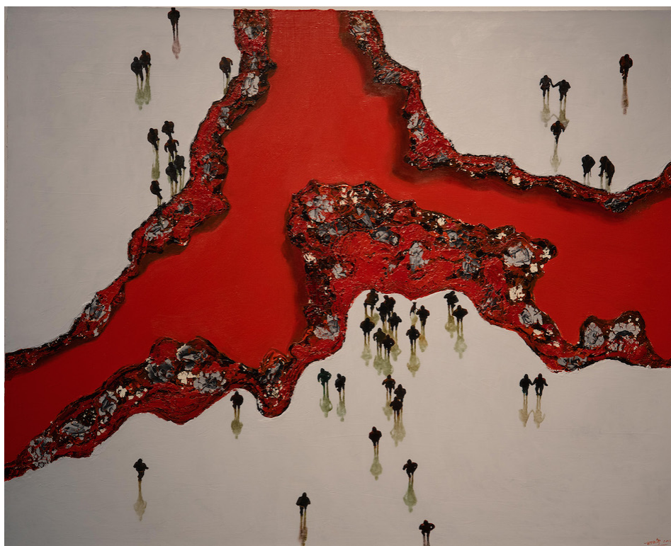
Hu Weiqi 胡卫齐, A Quiet Place 寂静之地 2 Mixed Media on canvas 综合材料, 130 x 160 cm, 2018

Exhibition Duration: 10 th January – 24 th February 2019